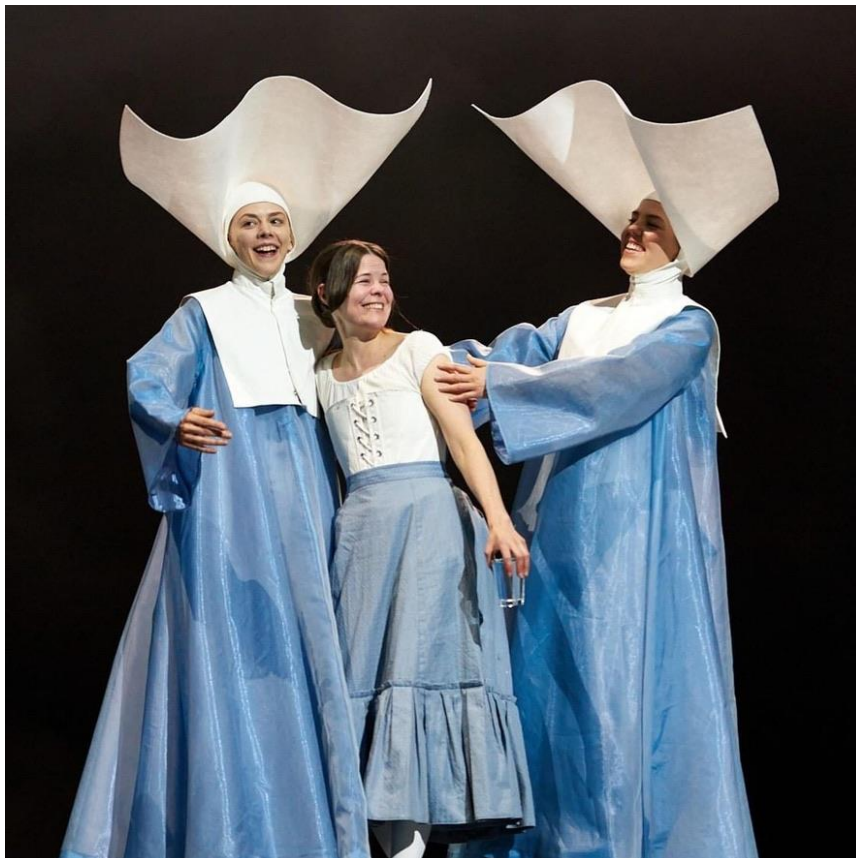
"The Flying nuns" from the National Theater's production of "Jane Eyre" 2022