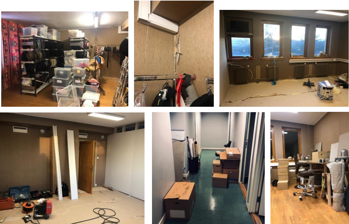
Building a new workspace at the National Theatre, moving my studio, and settling in. March 2022.

In dialog with The Norwegian Crafts Institute and the head of costume at the theatre, we concluded that the permanent in-house milliner position I was offered would only be possible if I could move my studio and the scholarship work into the studio the theatre was making available for me. We have also found that it would benefit both the theatre and my project if we could combine some of my research and practical work with the hats made for stage at the theatre. It is great to see the work being used; enjoyed by the actors and audience; and gaining information on how techniques I am developing and trying works during repeated heavy on stage use.