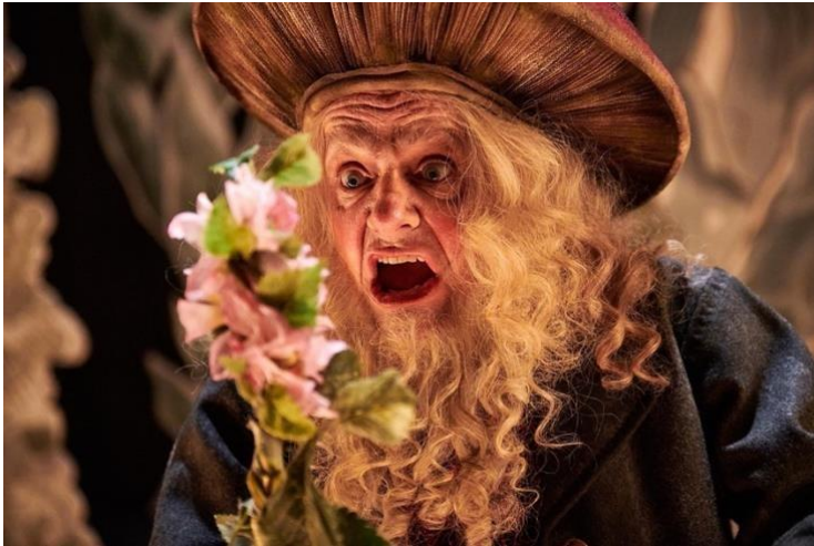
from the performance