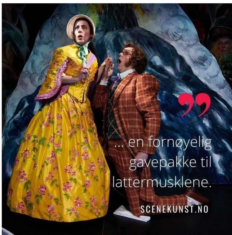
from the performance