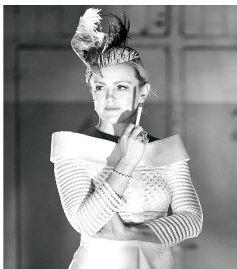
from the performance 2022