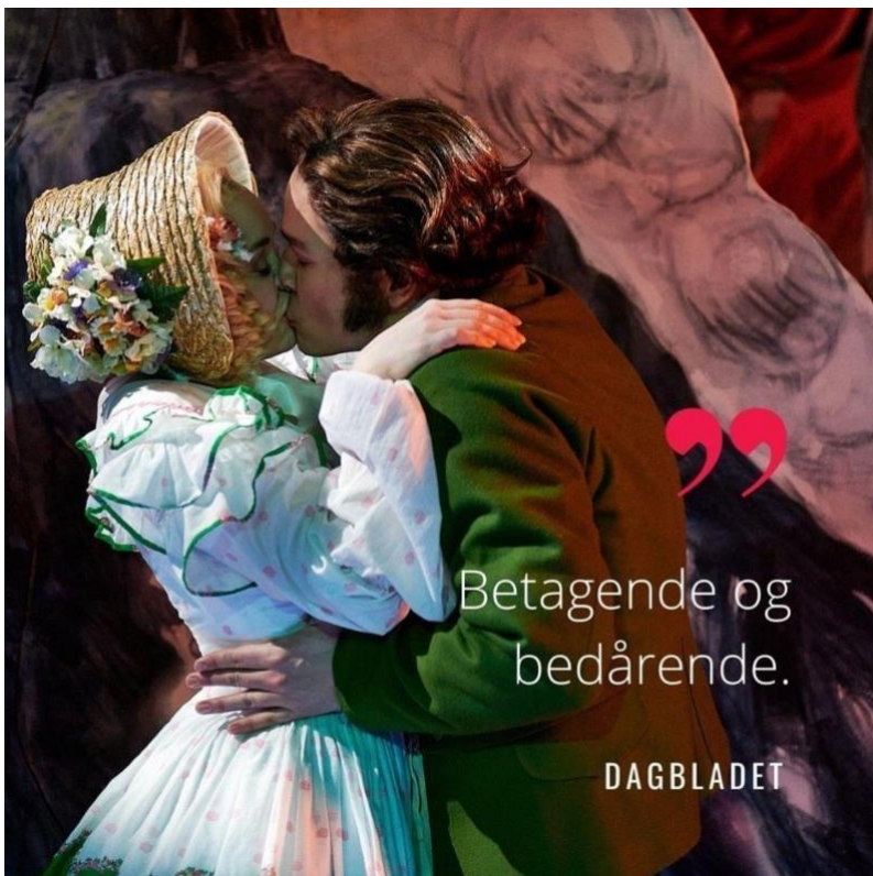
from the performance