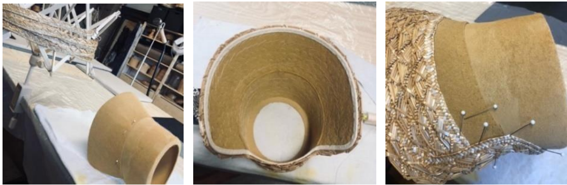
One of the bonnets I made for this production, character was a young woman. Photos from the making in my studio.