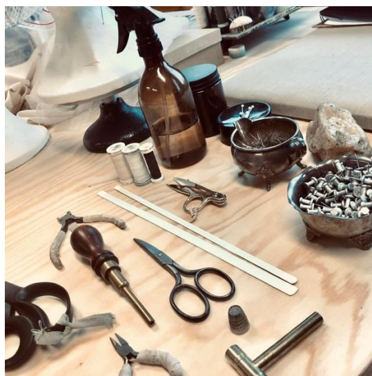
Treasured tools, in daily use at my studio

Dyeing: I'm well on my way with the dye work. However, as I move along, doing a cost analysis and broadening the specter of dyes will be useful. I would like to consult with experienced dyers and do some workshops the coming year, to supplement the experiments and insight I am gaining from the work in my studio.